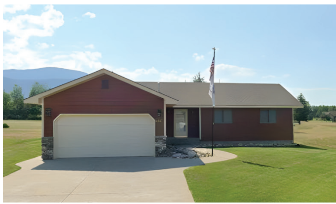
Clay and Lynne Cummins' vacation home in Red Lodge, MT

While individuals retain the right to use their property, they continue to be responsible for all routine expenses - maintenance fees, insurance, property taxes, repairs, etc. When the retained life estate ends, NWC Foundation can then use the property or the proceeds from the sale of it for the purposes designated by the donors.